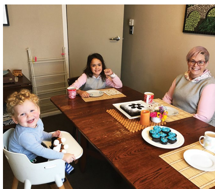
Sarah's Cuppa Tea

Motor neurone disease touches numerous lives, yet many Kiwis are unaware of the disease and its impacts. That's why we dedicated the entire month of June to raising awareness.