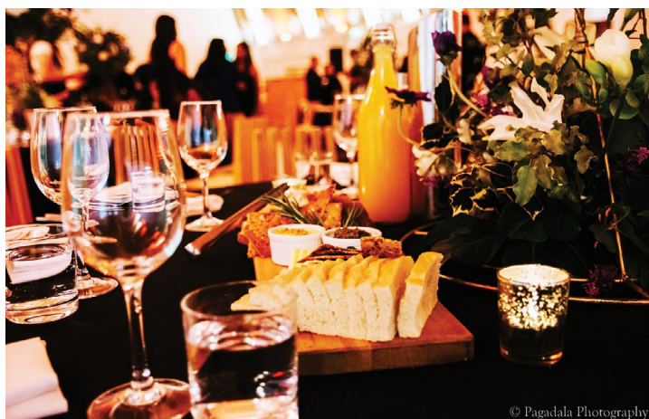
The Christchurch Transitional Cathedral was an excellent venue.