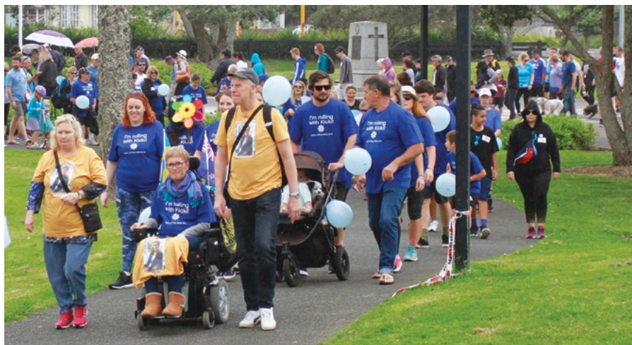
Auckland – The sun shone on the country for Walk 2 D'Feet MND 2018

The New Zealand Walk 2 D'Feet MND will take place again in 2019 on Sunday 10 November.