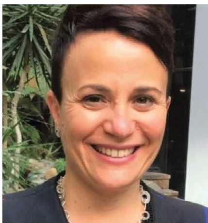
Disability Rights Commissioner, Paula Torsoriero