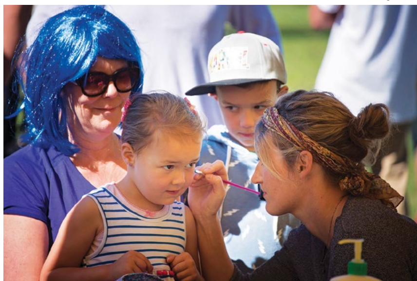
Face painting at Walk 2 D'Feet MND