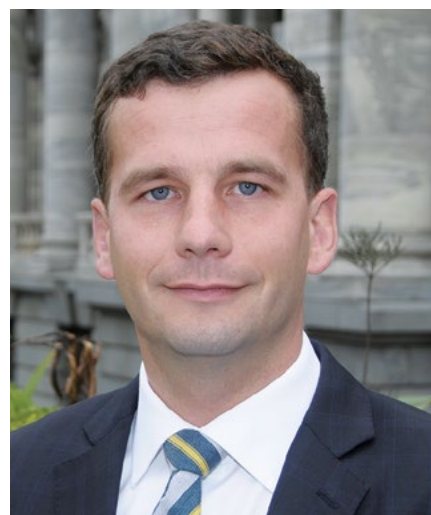
Act MP David Seymour

"There is a myth out there that palliative care and assisted dying are competing alternatives. Places like Europe with good palliative care does not change some terminally ill people still choosing assisted dying."