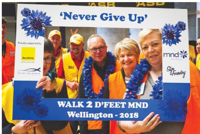
They never give up in Wellington